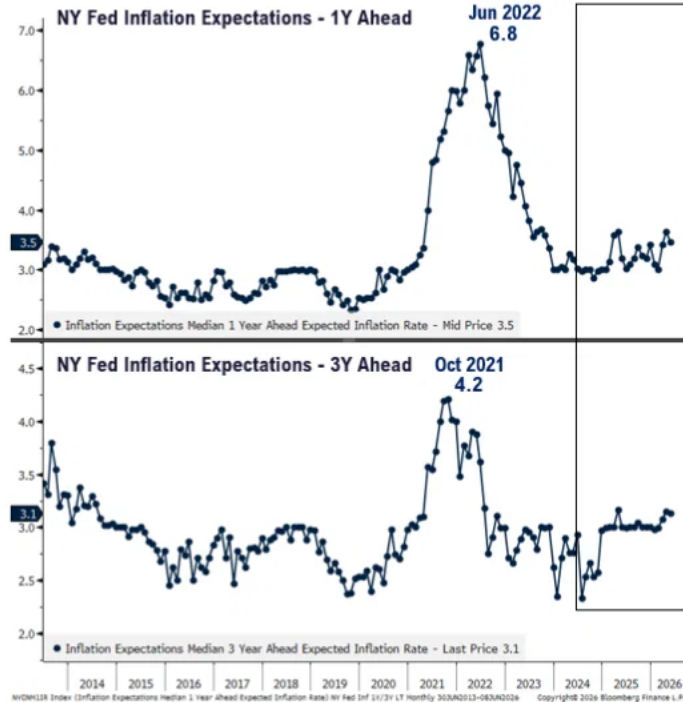
NY Fed Inflation Expectations (1Y and 3Y) Ahead Since 2013